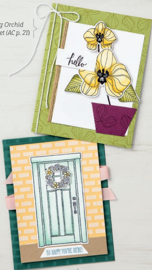
At Home with You Stamp Set (AC p. 54)